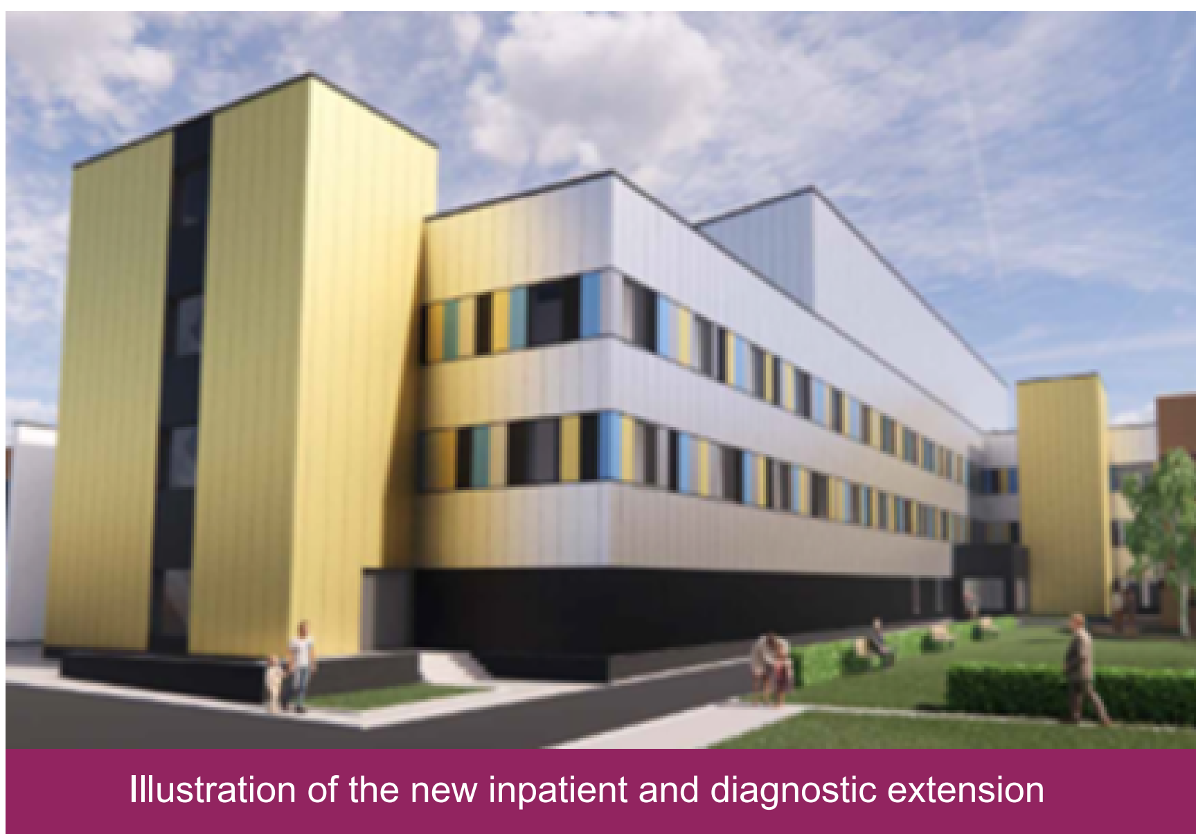
Illustration of the new inpatient and diagnostic extension

It will also enable more efficient ward refurbishments and reduce the disruption caused by the ongoing remedial work to keep areas affected by reinforced autoclaved aerated concrete (RAAC) safe.