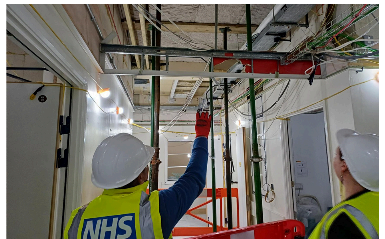
RAAC in theatres at Frimley Park Hospital