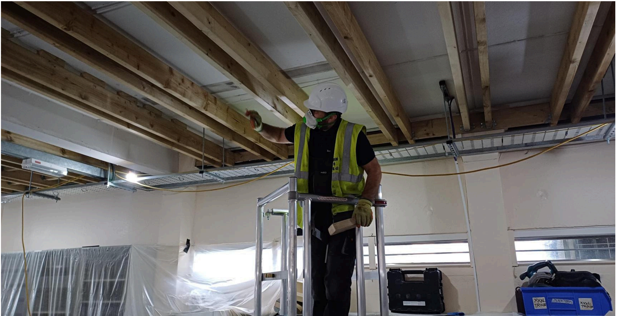
Capital Projects team managing RAAC at Frimley Park Hospital

Find out what our Capital Projects team are doing to manage RAAC at Frimley Park Hospital , and how we are maintaining both clinical and operational areas of the site to ensure it is safe for our patients and staff.